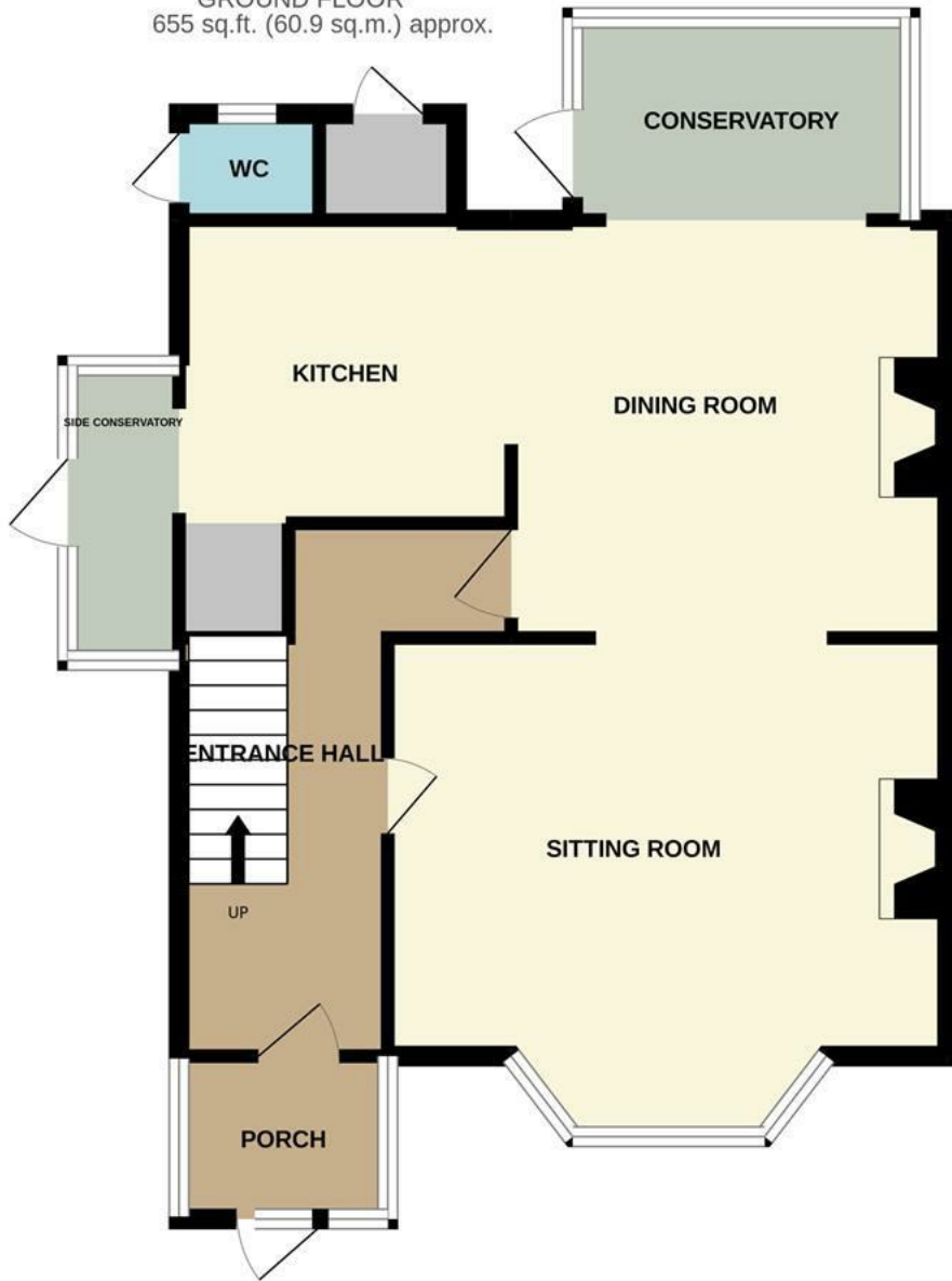
GROUND FLOOR 655 sq.ft. (60.9 sq.m.) approx.